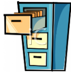
database of reusable comments